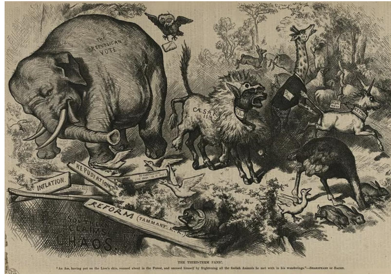
Thomas Nast, 1874